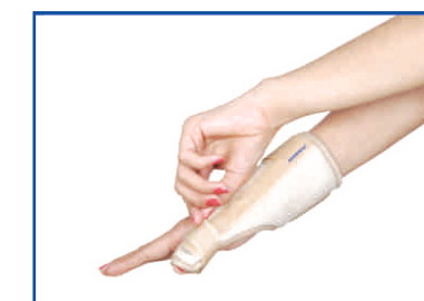
THUMB SPICA SPLINT ACWFS05