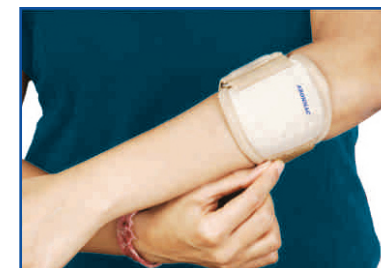
TENNIS ELBOW BRACE

Measure the circumference of the chest below the underarms