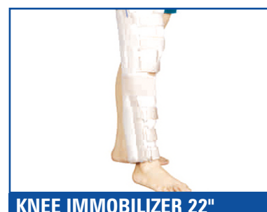
KNEE IMMOBILIZER 22" ACAKS04