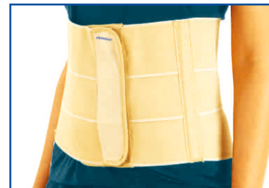
WAIST TRIMMER 8"