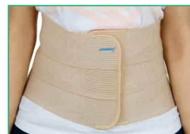
WAIST TRIMMER 8" ACAPS02