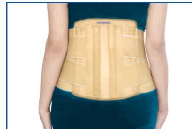
CONTOURED LS BELT ACWS08