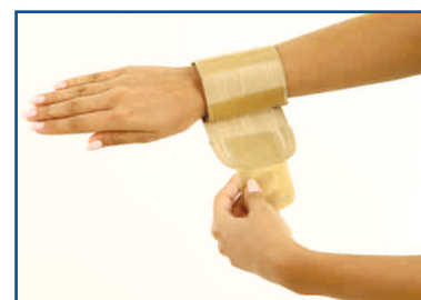
WRIST WRAP ACWFS01