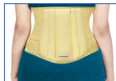
LUMBAR SACRO SUPPORT

Measure the circumference of the abdomen at the navel point