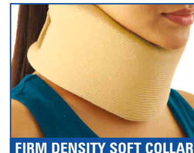
FIRM DENSITY SOFT COLLAR