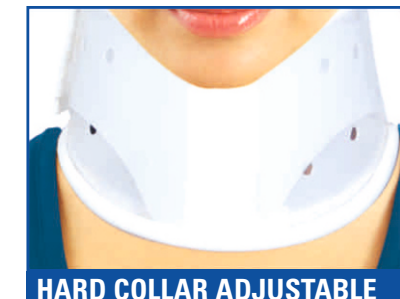
HARD COLLAR ADJUSTABLE