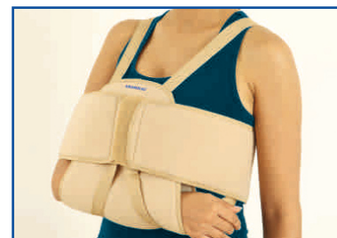
DELUXE SHULDER IMMOPLIER

Measure the circumference of the chest below the underarms