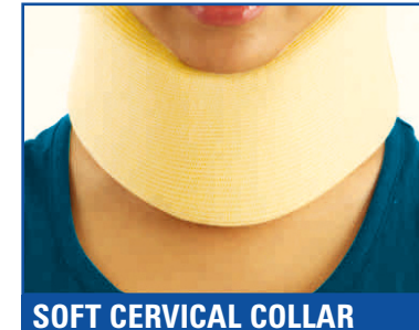
SOFT CERVICAL COLLAR

Our Quality Assurance have earned us ISO 9001:2015 and ISO 13485:2012 certifications. Our products manufactured have CE marking as per Medical Device Directive 93/42/EEC certifications.