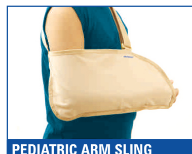
PEDIATRIC ARM SLING ACPS02