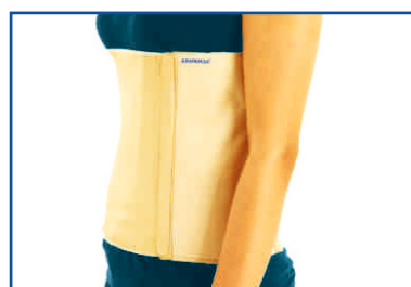
ABDOMINAL BINDER 10"

Measure the circumference of the chest below the underarms