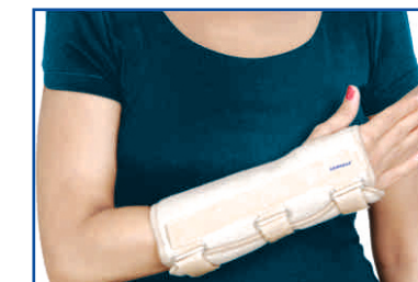
WRIST & FOREARM BRACE ACWFS04