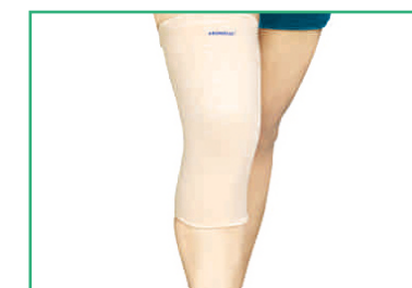
KNEE BRACE ACAPS04