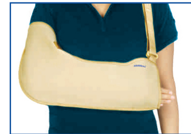
DELUXE ARM SLING (TROPICAL)