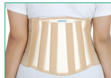
LUMBAR SACRO SUPPORT ACAPS01