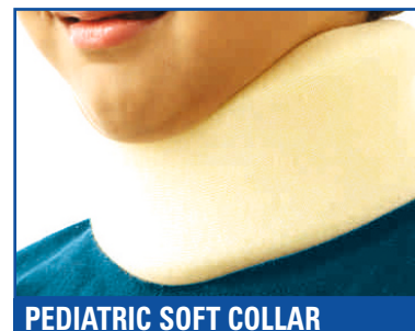
PEDIATRIC SOFT COLLAR ACPS01