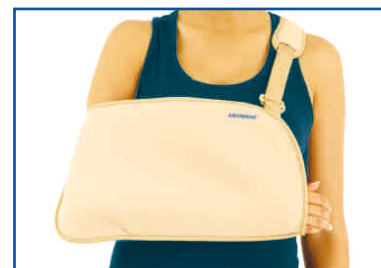
DELUXE ARM SLING POUCH