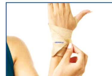
WRIST SUPPORT ACWFS02