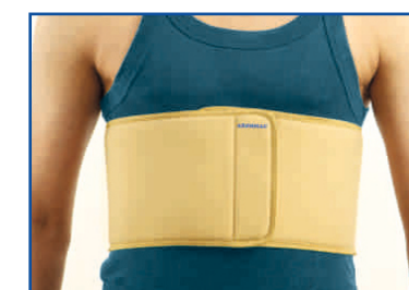
RIB BELT MEN

Measure the circumference of the abdomen at the navel point