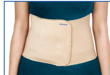
NEOPRENE ABDOMINAL BINDER ACWS10