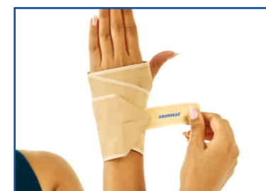
WRIST BRACE ACWFS03