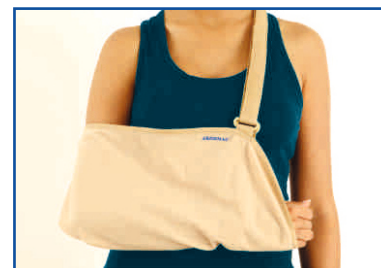
ARM SLING POUCH