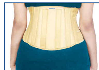
LUMBO SACRAL BELT ACWS09

Measure the circumference of the abdomen at the naval point