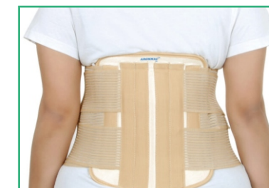
CONTOURED LS BELT ACAPS03