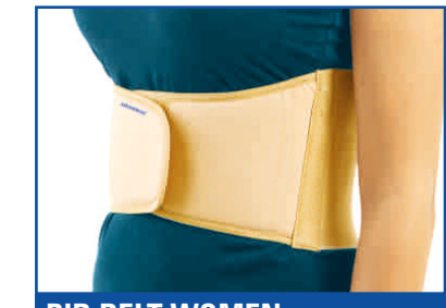
RIB BELT WOMEN

Measure the circumference of the abdomen at the navel point