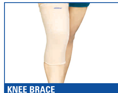
KNEE BRACE ACAKS03